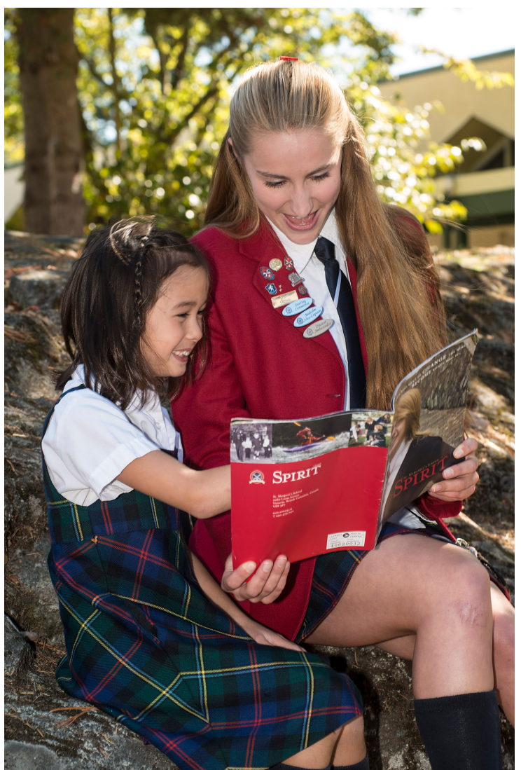
a premier environment for girls of all ages to learn.

That tight-knit community truly starts with their staff, and maintaining the personalized attention which makes St. Margaret's School