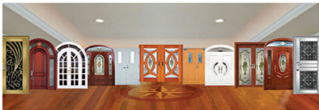
Custom & Imported Doors: Teak, Mahogany & Steel

MANUFACTURERS & EXPORTERS: Unique Woodworking (Trinidad) Ltd. & Unique Lumber (Guyana) Inc. Specialize in Custom Joinery Products and Installations.