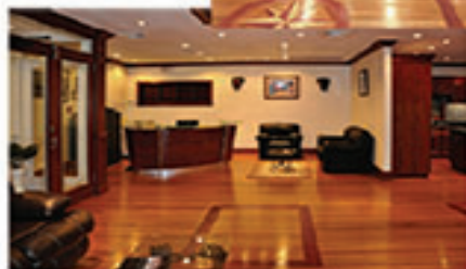
Showroom With Kitchen, Hardwood, Engineered & Bamboo Floors