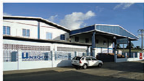
Factory & Warehouse